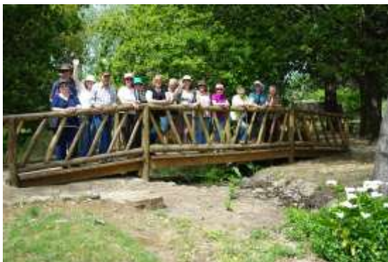
FMBG Field Trip to Buninyong Botanic Garden