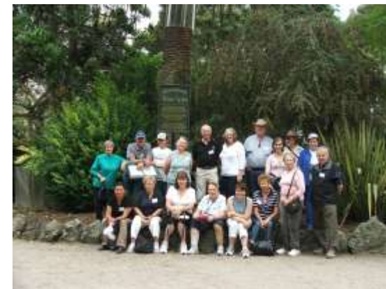
St Kilda and Williamstown Botanic Gardens FMBG Field Trip