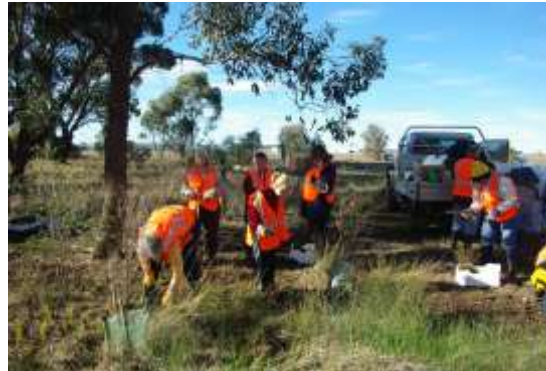
Growing the Garden – Ryans Creek Rehabilitation Project Planting and showcasing indigenous plants in the Melton Botanic Garden

Funding from FMBG, MSC, Melbourne Water & V4WP