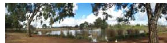
Melton Botanic Garden