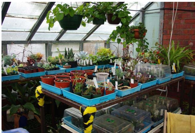
(Inside Ballarat Friends propagating glass house)