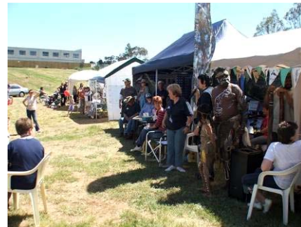
(Opening the Festival – with welcome to country)

This event was organised by Friends of Toolern Creek. FMBG set up an information stall and we also sold plants. A warm, sunny and windy day. Good atmosphere and opportunity to meet other environmental groups and visitors.