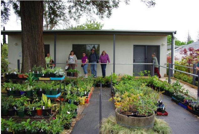
(George Longley Building and Friends Plant Sales area)