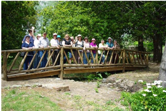
(Friends at Buninyong Botanic Garden)