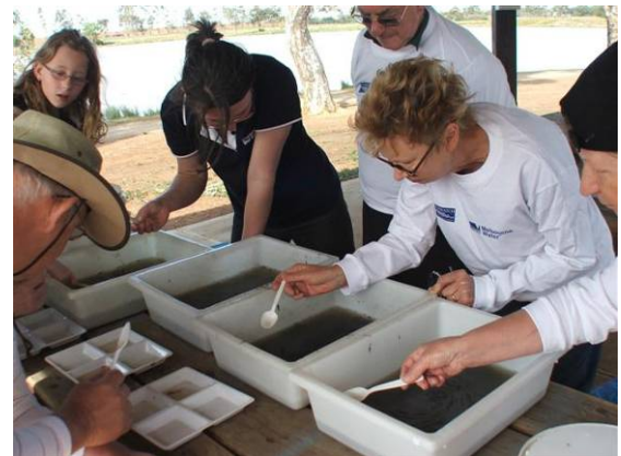
(Bug inspecting and counting)

Great fun - some of us even cleaned up focussing on Ryans Creek and the north side of the lake. As usual we had a bite to eat and something to drink afterwards. Come along and join in next time for some fellowship and fun.