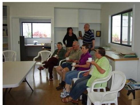
(Morning tea with Friends)

We were welcomed by the Friends of Ballarat Botanic Gardens who provided a morning where we talked about each group's activities. The morning tea was held in their recently opened Friends Centre called the George Longley Building which is named after the gardens first curator.