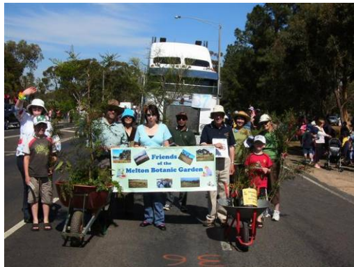
Djerriwarrh marchers 2007 Let's make 2008 even bigger!

Here is another chance to help promote the Melton Botanic Garden