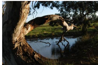
(Lagoon – Louise Robinson)

The lagoon is a great place to capture some bird life and also relax.