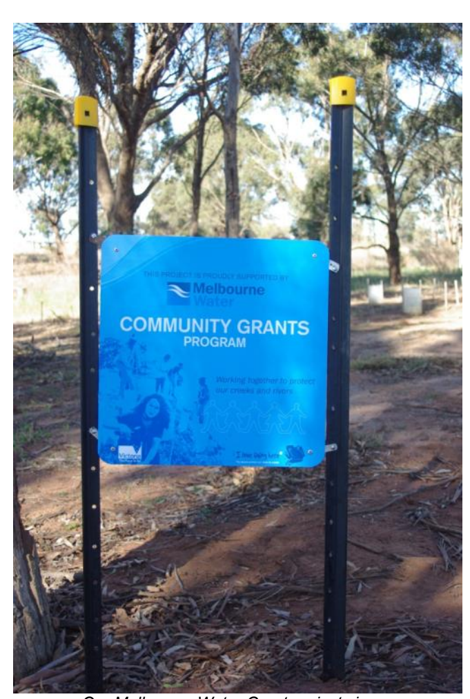
Our Melbourne Water Grant project sign