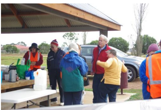
Having a good time and a chat after the clean up