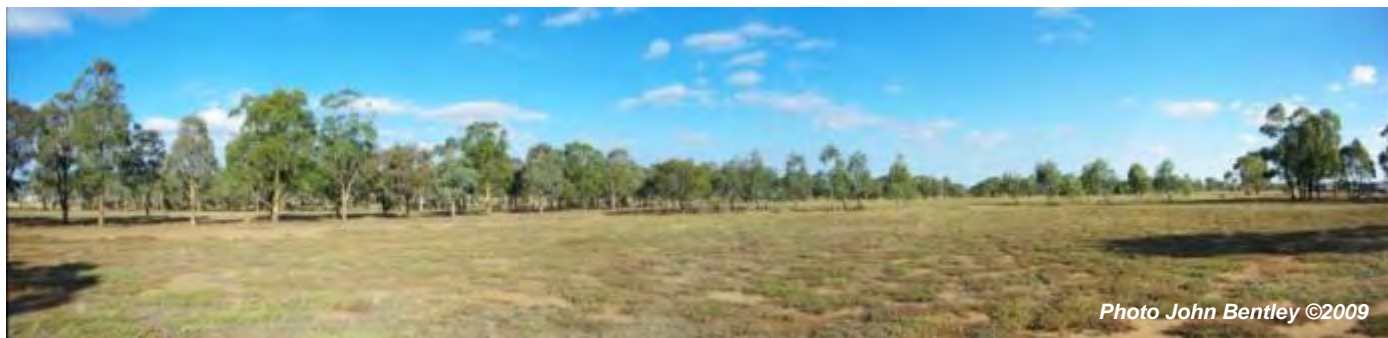
Photo: Eucalyptus Arboretum area looking south - Melton Botanic Garden site