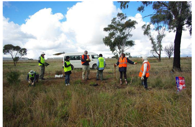
Clearing and planting