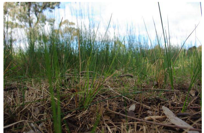
Some FMBG plantings close up

Please ensure that your name appears under the transaction details. In addition, also submit the form or email to friends@fmbg.org.au