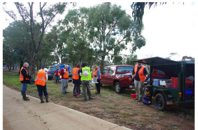
Enjoying morning tea

Next Grow the Garden Days are Thursday 12 th August and Sunday 22 nd August. We hope to see you there.