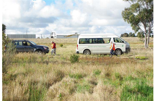
Conservation Volunteers Australia on 25 th July

We held GTGDs on Thursday 8 th and Sunday 27 th July. Conservation Volunteers Australia joined us on 27 th and many FMBG members worked until 3pm. This was a great effort. Take a stroll along Ryans Creek to see the planting and rehabilitation. Thanks to everyone who came along and helped.