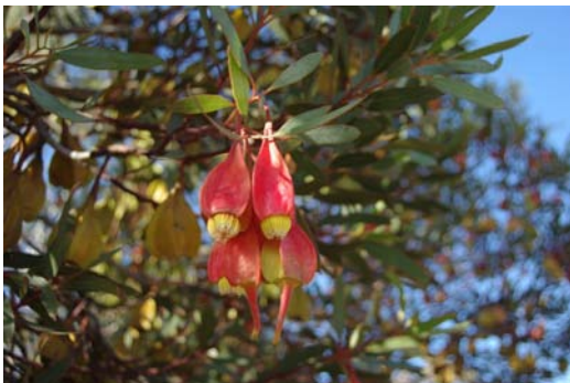
Fuschia Gum ( E.forrestiana ) Melton Botanic Garden

Categories include: Wildlife and plants, botanic garden scenes, flowers, close-up of plants, people and botanic gardens, objects and plants and a general section for anything else.