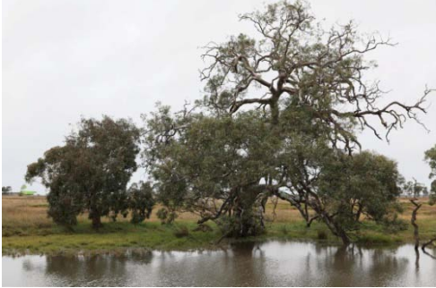
Old River Red Gum MBG

If you are free please come along to help set up at 11.30am. We will have have tea and coffee. Or may be take walk through the garden at that time so it looks like people are in the area.