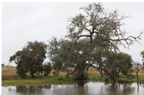
Old River Red Gum MBG

http://www.flickr.com/photos/keepaustraliabeautifulvictoria/sets