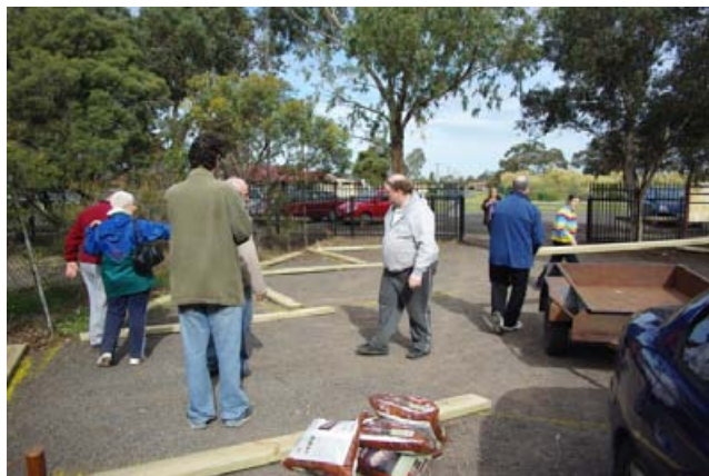
The first working bee to build the Roy Gabb memorial Garden