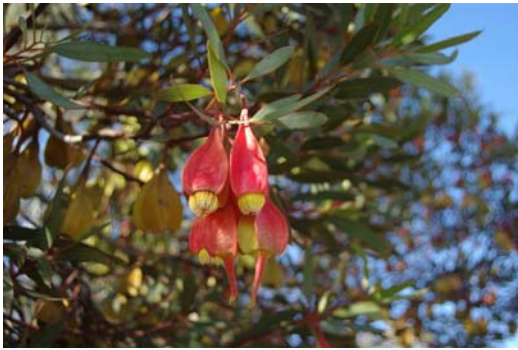
Fuschia Gum ( E. forrestiana ) Melton Botanic Garden

Categories include: Wildlife and plants, botanic garden scenes, flowers, close-up of plants, people and botanic gardens, objects and plants and a general section for anything else.