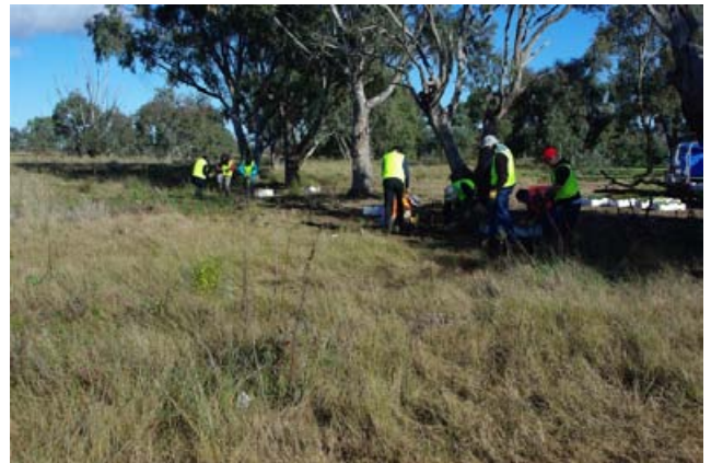
Conservation Volunteers Australia Planting

Margaret Peters has more details on all these plants if anyone would like them.