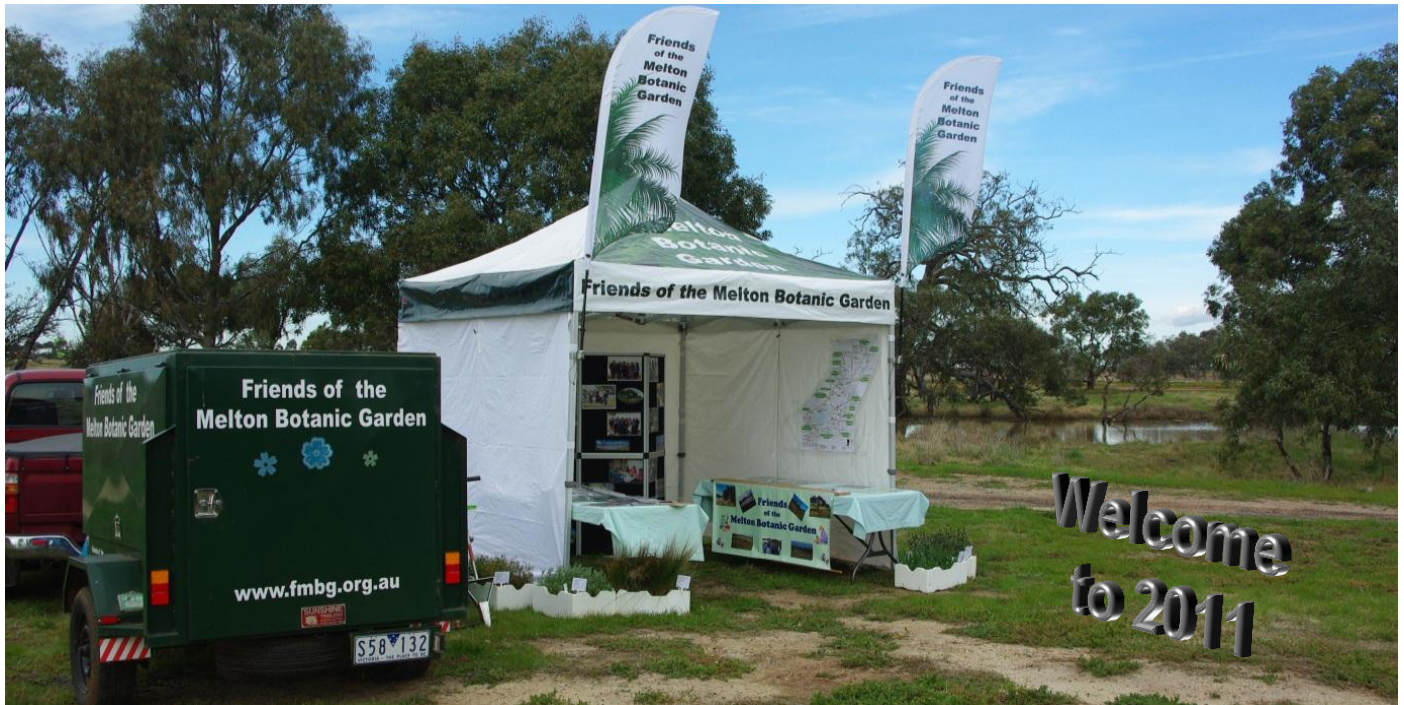
Photo: FMBG display at the Melton Botanic Garden