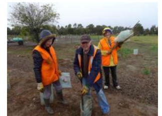
It was easy to get the sticks in the ground