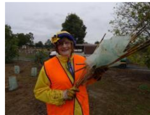
A cold and wet but a happy gumnut

Thursday 21st June was a really wet day for the workers (maybe they should be called the Gumboots group). The group persisted through the rain and cold and got many plants into the wet ground. They also got pretty muddy.