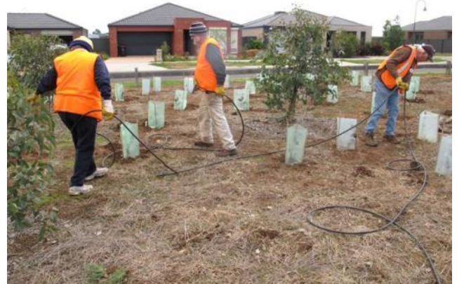
Watering the plants