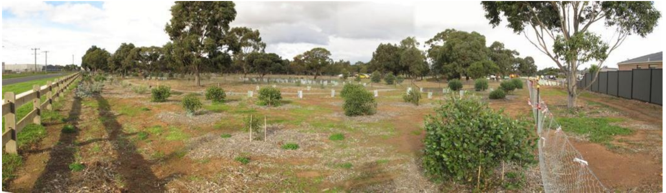
Eucalyptus Arboretum – from north-west corner on 30 June 2012 – Community Planting Day