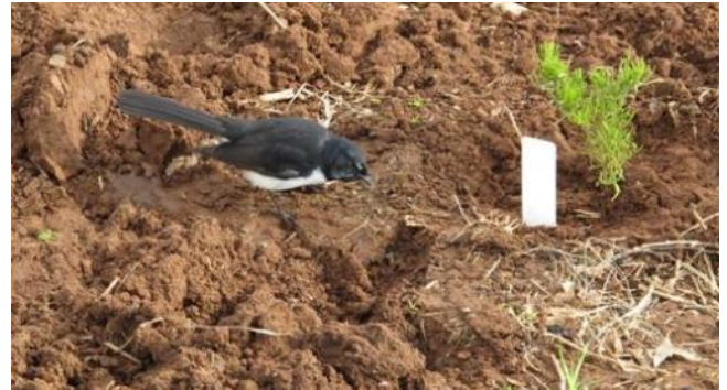
Willie Wag Tail at the Community Planting Day

Stop for lunch or a tea break and they will be at your feet picking up any crumbs. They come very close when digging as they like to get close to pick up any worms or insects they can see in the fresh diggings (also see the Gumnuts report for their experience).