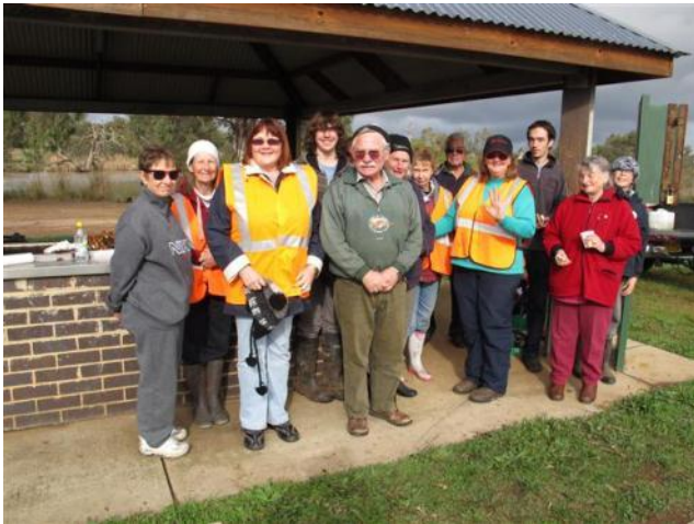
The Clean Up Day gang