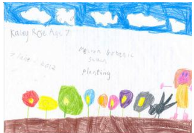
Kaley Roe's picture of the Melton Botanic Garden

Dave and Barb Pye are off to Central Australia for 6 weeks for a well earned break. Barb Pye received a drawing from one of our younger members, Kaley Roe, who had been planting with Barb in the Eucalyptus Arboretum at a Community Planting Day.