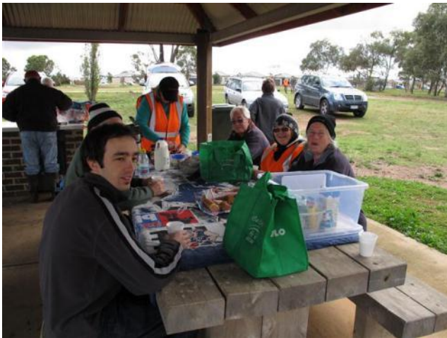
Enjoying the lunch at the Clean Up Day