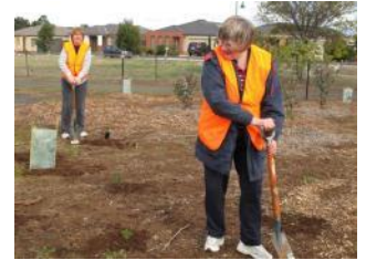
CWA members with the trees and shrubs they planted