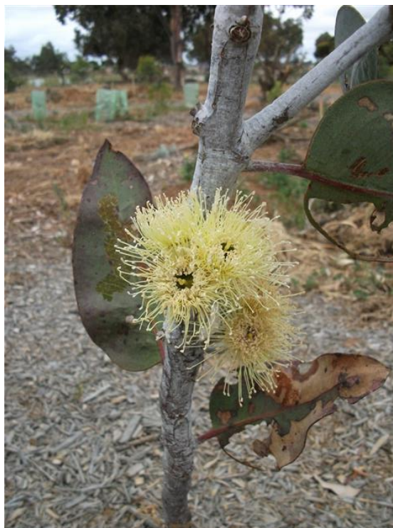
Eucalyptus woodwardii (Lemon-flowered Gum)