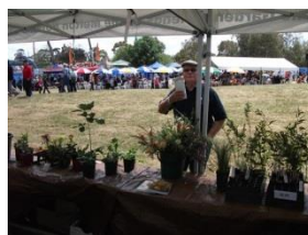
Plants for sale

We certainly interacted with the public in promoting the botanic garden and selling plants. We kept up our networking with MCC staff and councillors.