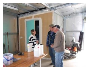
Members have a chat in the shed