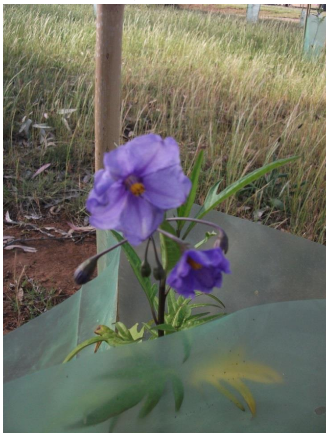
Solanum laciniatum (Kangaroo Apple) near the new toilets