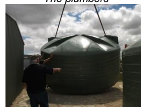
Water tanks being placed