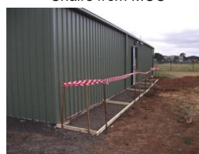
Path ready for concreting by CVGT team