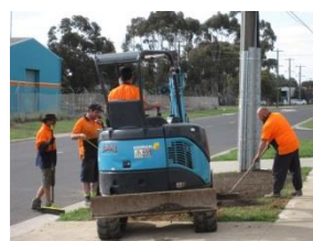
UAG working on the power connection pit and trench