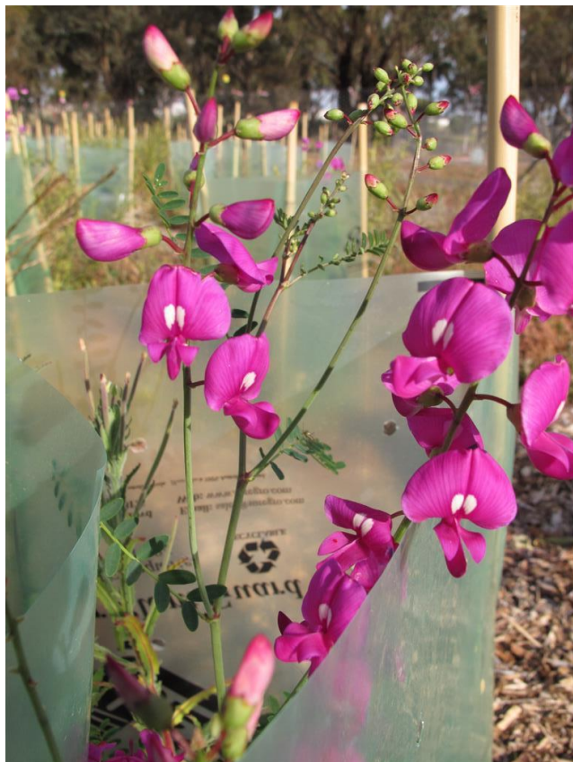
Swainsona galegifolia (Smooth darling pea) in flower in the Eucalyptus Arboretum.