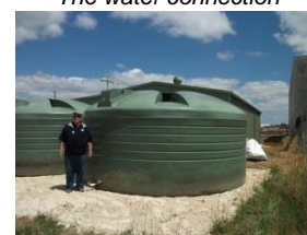
Water tanks in position