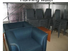
Chairs from MCC