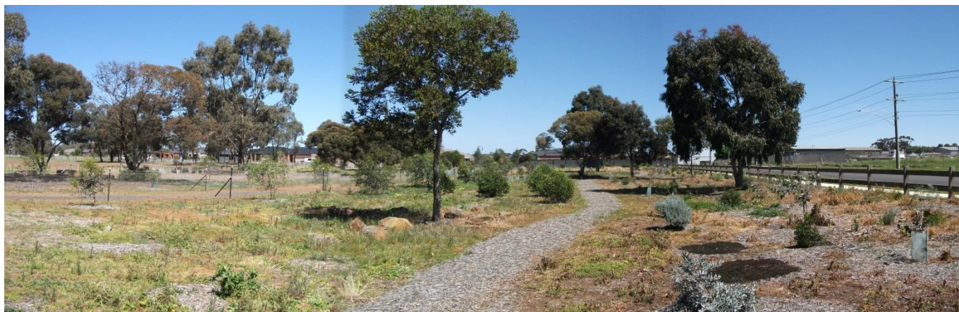
Eucalyptus Arboretum North West Section Looking West - 14 October 2012