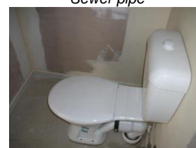
The you know what