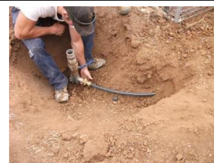
The water connection