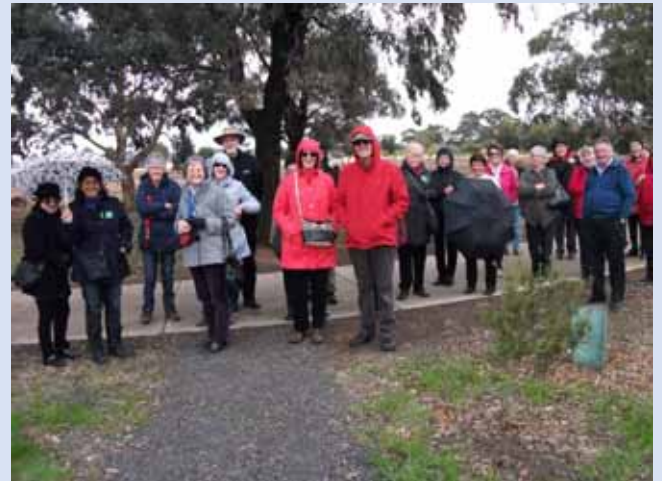
Some of the visitors on the tour.

It was a cold day but we enjoyed morning tea together and the group had time following the walk to purchase plants at the Nursery. We also received a sizeable donation from the group which will help build the garden.