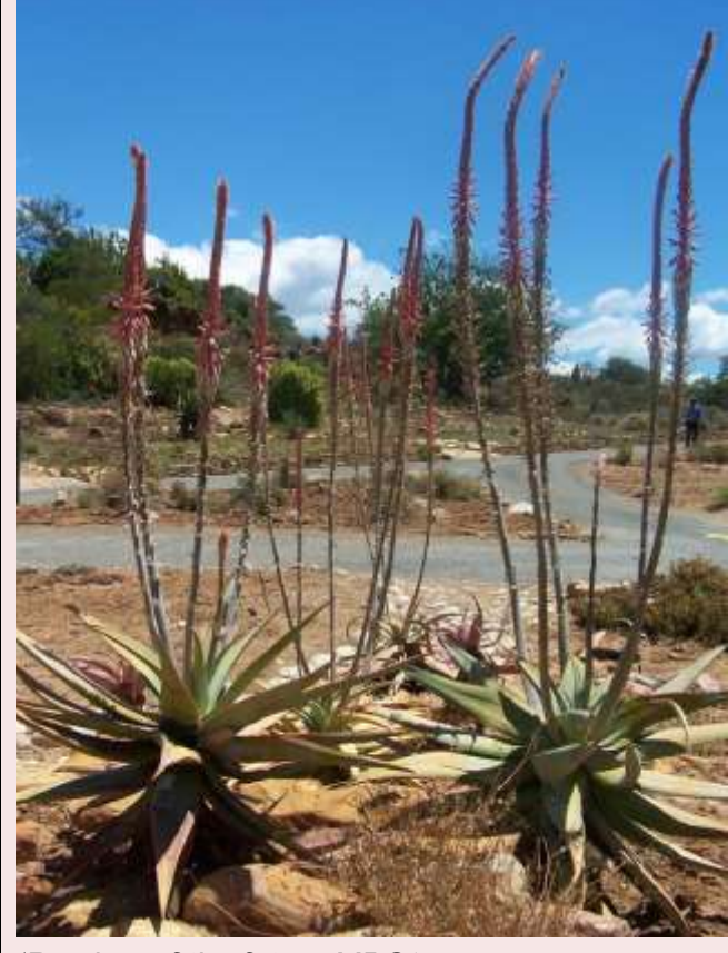
'Preview of the future MBG'