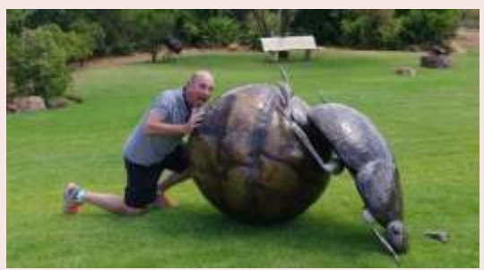
Not quite an Australian theme but perhaps an example of what is possible in a Botanic Garden (hopefully without Steve in the sculpture)