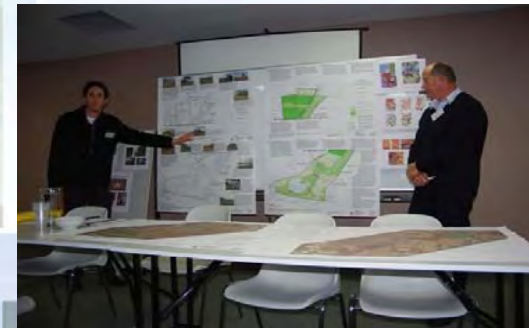
Michael Smith and Associates Landscape Architecture & Urban Design