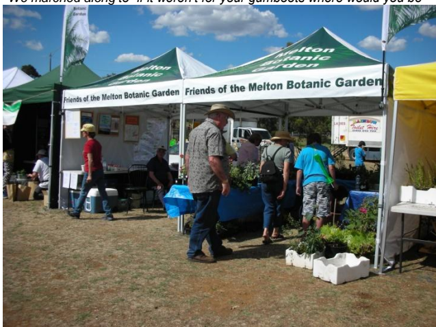
FMBG marquees – information and plant sales

A good fun day and we raised $557.50 for FMBG.