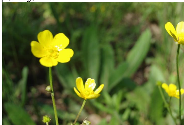
... and here they are on mass

Native ranunculus below at Ryans Creek in the Melton Botanic Garden – self seeding from 2008 plantings