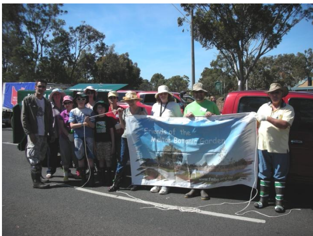
FMBG parade participants – note gum boots We marched along to “if it weren't for your gumboots where would you be”