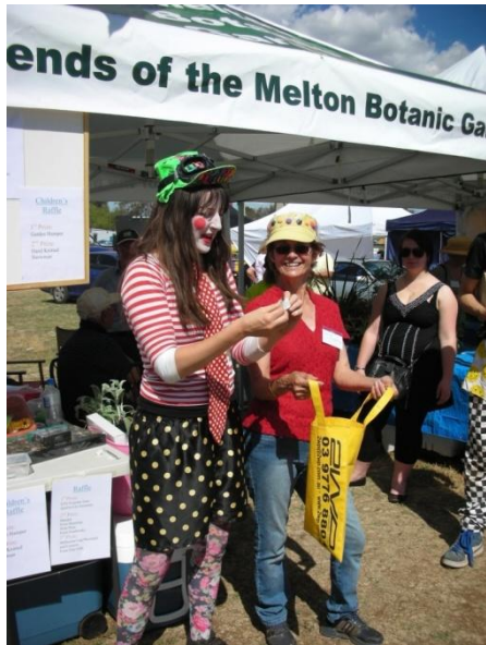
Vox Bandicoot – and the winner is? - drawing the raffle winners