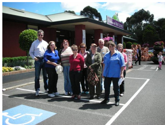
The field trip participants