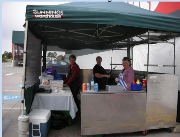
At the last sausage sizzle on 22 nd December we raised $550 (photo of the happy helpers). Great work everyone and much appreciated.