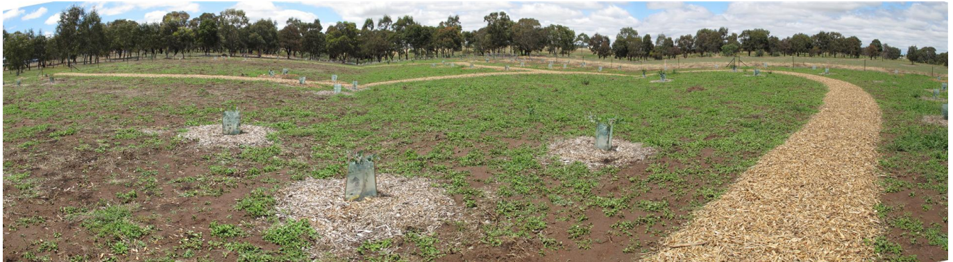
Photo: Melton Botanic Garden – Eucalyptus Arboretum South Western section November 2011