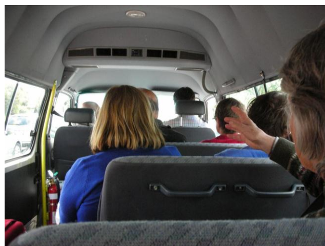
Fun from the back of the bus