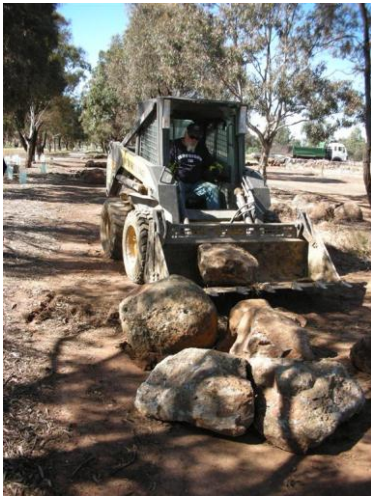
Kelvin moving rocks

Some activities in December included weeding and moving rocks.