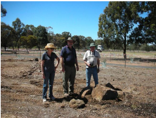
Admiring some of the placed rocks