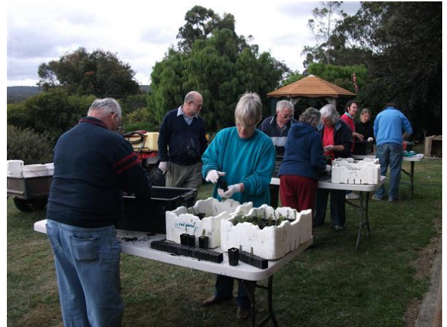
Everyone potting away

In January on a cool night we had a great group of volunteers pot up many of the understorey we propagated from cutting at the October meeting. It certainly was exciting potting up the babies we started. We should be planting these in June this year. We are expecting to plant around 20,000 understorey plants in the Eucalyptus Arboretum this year. The Gordon (Institute of TAFE Geelong) are propagating about 5,000 difficult to grow species in Geelong for the arboretum. Western Plains Flora is propagating many other species.