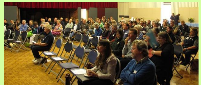
BGANZ Audience – MSC Community Hall

Many thanks to our sponsors Western Land Services in funding the catering for the day, and Witchmount Estate and Galli wineries for providing the gifts for the speakers. Thanks also to the Melton Shire Staff for their assistance and MSC for providing the venue.