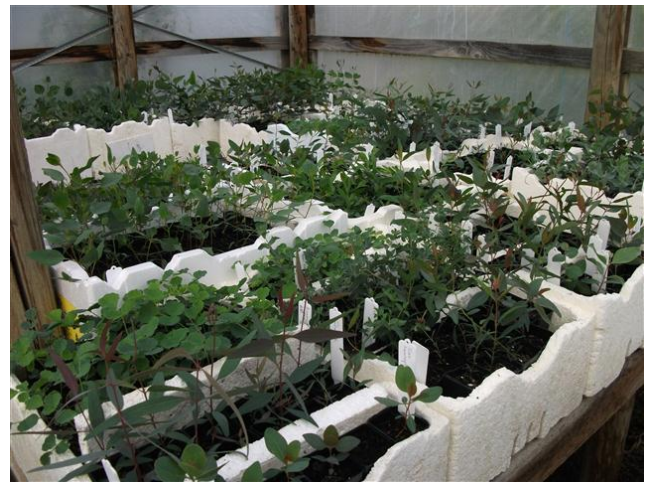
The plants in the hot house

In January on a cool night we had a great group of volunteers pot up many of the understorey we propagated from cutting at the October meeting. It certainly was exciting potting up the babies we started. We should be planting these in June this year. We are expecting to plant around 20,000 understorey plants in the Eucalyptus Arboretum this year. The Gordon (Institute of TAFE Geelong) are propagating about 5,000 difficult to grow species in Geelong for the arboretum. Western Plains Flora is propagating many other species.