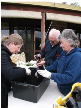
Potters hard at work