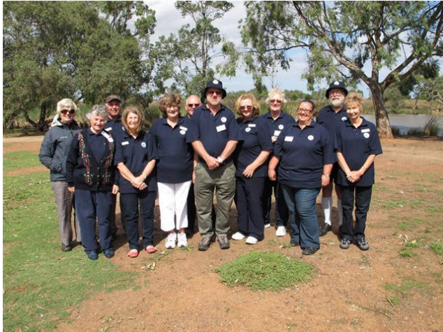
FMBG Volunteers in the new polo tops and hats

Recently FMBG received an MSC Collingwood Community Grant to purchase tops and hats to assist in FMBG identity and also to purchase new mail merge software for improved electronic communication to members. We proudly wore our tops and hats for the first time at the BGANZ Network meeting. We looked really good (see photo).