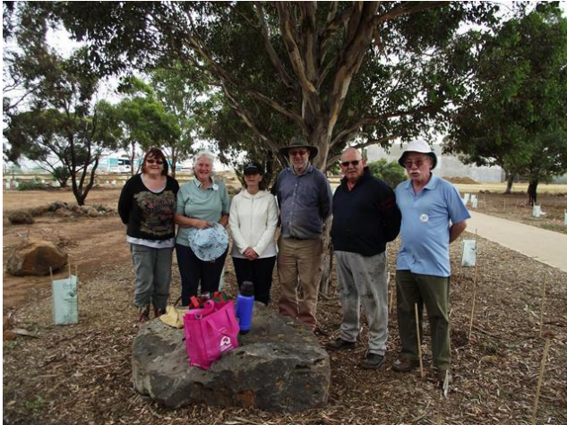
Gumnuts – 1 st Day

The Eucalypts are growing well. Some even needed staking as they are getting too top heavy with so much new growth. Rain in February and warm warmer have given them a further spurt.