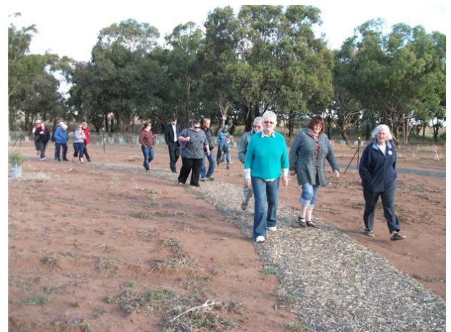
Walking through the Eucalypts Arboretum

Many thanks to Western Land Services for donating services to the value of $1,000 for use in the Melton Botanic Garden