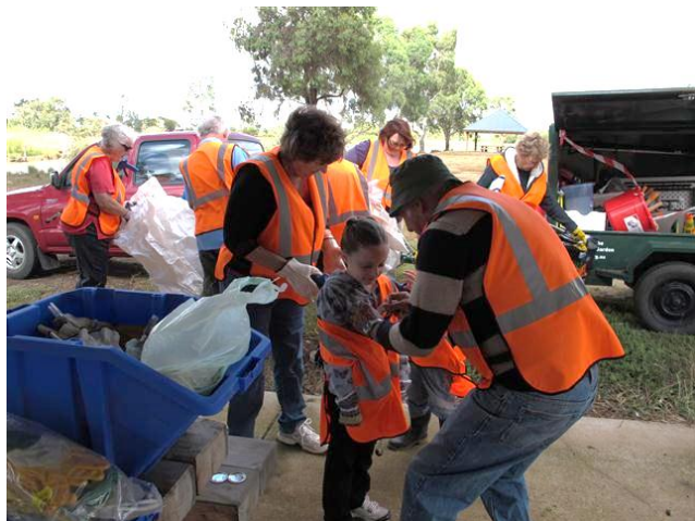
Everyone getting ready for the clean up