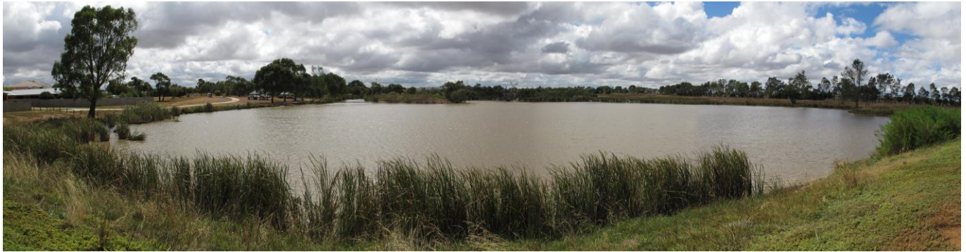
Photo: Melton Botanic Garden – Botanic Garden Lake February 2012