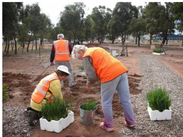
Some of the team planting Dianellas brevicaulis