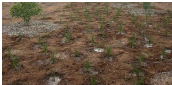
Some of 350 Dianella brevicaulis planted on April 26 th