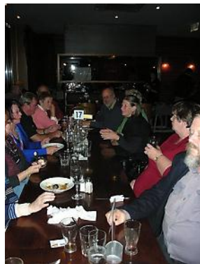
Enjoying the social dinner