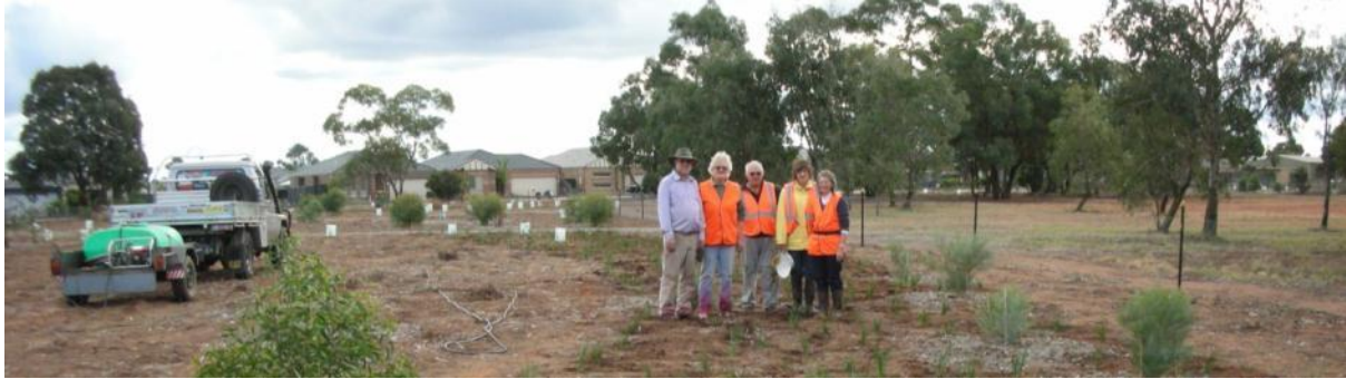
Photo: Eucalyptus Arboretum – Planting Team on 26 April 2012 where 350 Dianella brevicaulis were planted