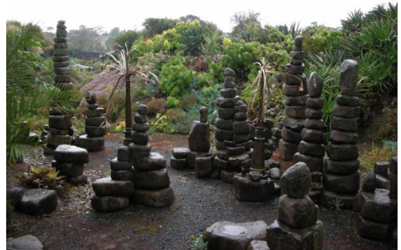
Attila Kappitany's Garden – using stones from the site

A bus load of FMBG and Melton Garden Club members visited Attila Kappitany's Garden and Kurunga Native Nursery in November.