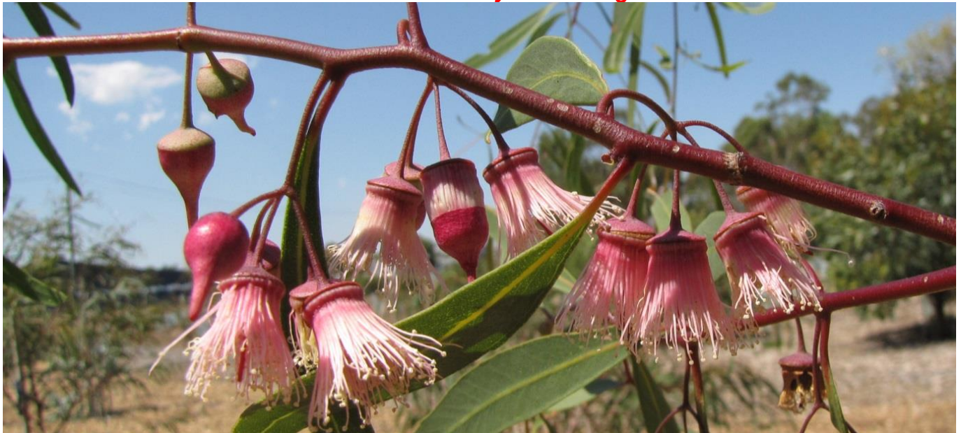
Eucalyptus Synandra - Eucalyptus Arboretum Eastern Section - Feb 2013