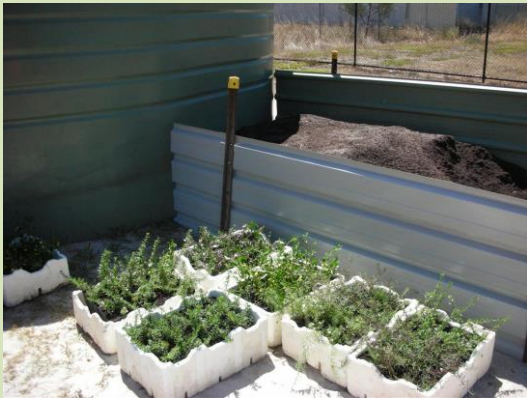
CVGT potted up these plants in February and many of these were propagated by the team in 2012 – well done