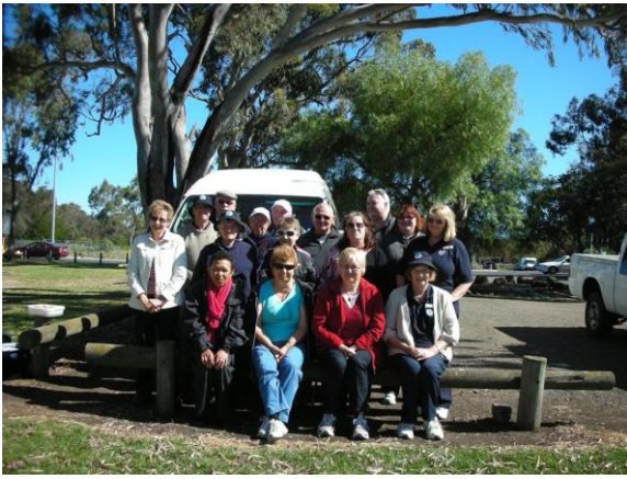
The November bus trippers