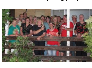
Goodbye from the balcony