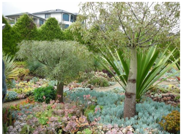
Attila Kappitany's Garden – Succulent display