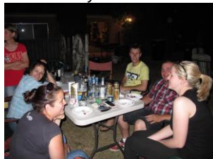
Wow! Some young people