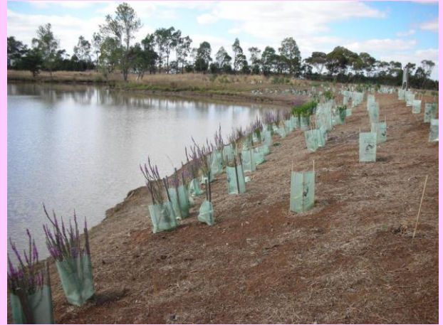
Purple loosestrife flowering along the lake wall. This work is being done by the Lakers group every second Tuesday. CVGT teams will be helping more this year on this project. This project was funded by a Melbourne Water grant in 2012. We have been successful in gaining a grant for 2013 to be able to continue the lake indigenous revegetation.