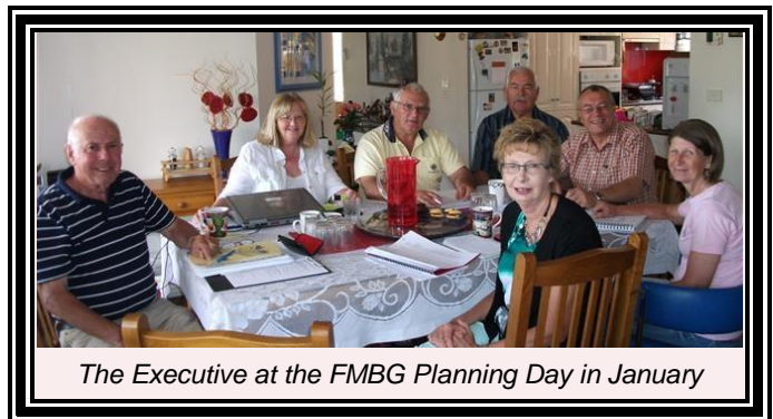
The Executive at the FMBG Planning Day in January

We also have an upcoming briefing to MCC in March.