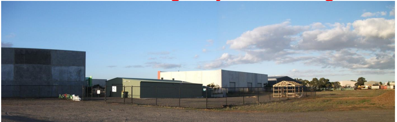
MBG Depot - April 2013