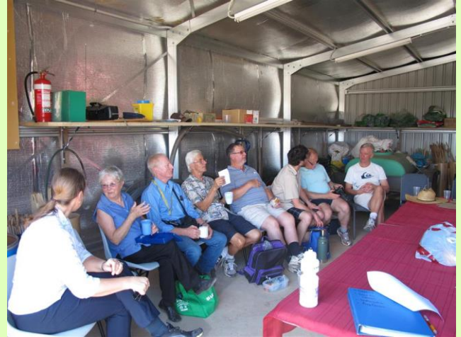
Members of Australian Pant Society Keilor Plains Group visited the Melton Botanic garden on Saturday 9 March. FMBG hosted a morning tea followed by a guided tour. The group at lunch at the depot.