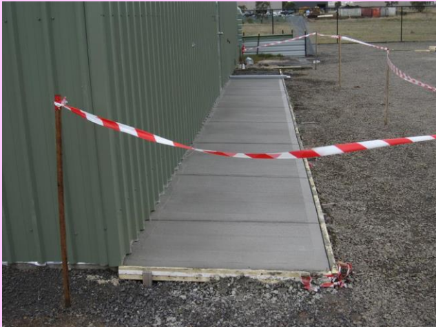
Freshly laid concrete path