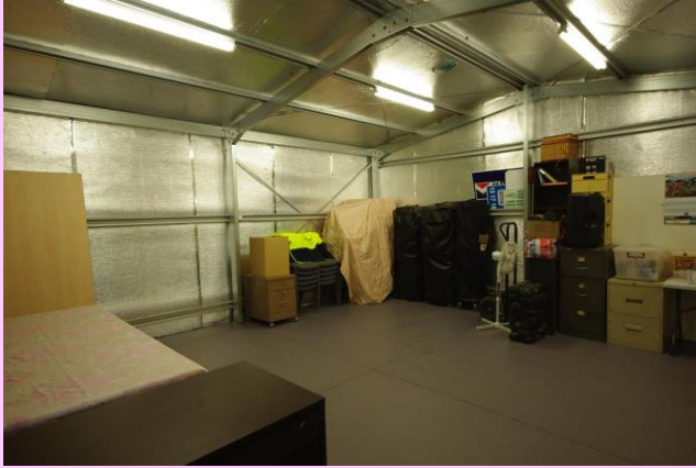
Inside shed showing the grey painted floor

Dave Peters is continuing to be hard at work in the Depot. Most recently he has painted the floor in the meeting, kitchen and toilet areas. The concrete path leading to the small entry door has been laid and is being used.