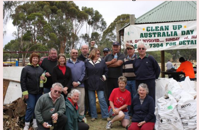
2009 Cleanup Australia Day

Also many thanks go to CVGT for their assistance in maintaining and watering the plants, trees and shrubs. Also to the PAG group (people with disability) who help out every month. Also before I forget, thanks to the students from the University Campus for their help in constructing the information shelter. Every little bit helps. Thanks.