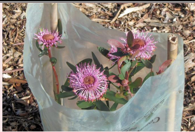
Isopogon growing beside the gate