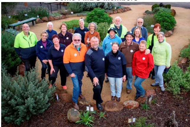
Some FMBG Members