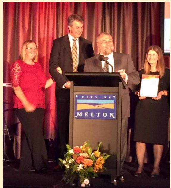
Speech on receiving the Access and Inclusion Award.