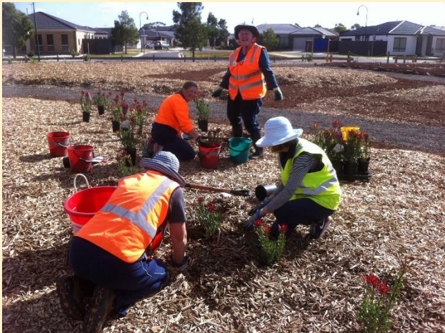
Planting in the Southern African Garden Proteaceae bed