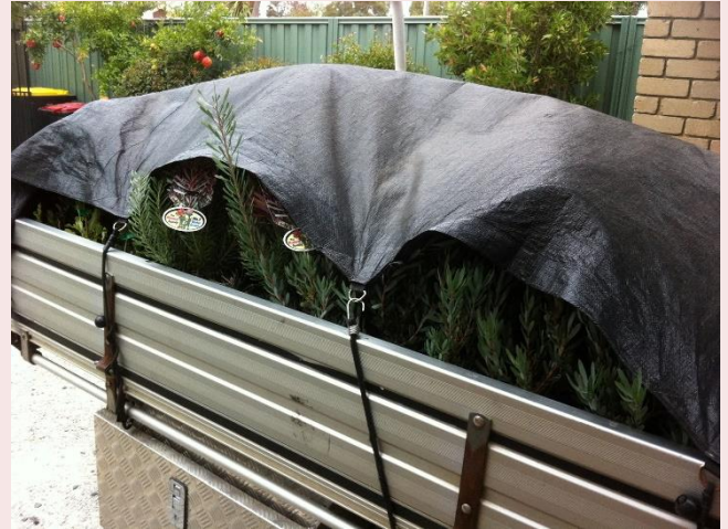
Back of the uteloaded