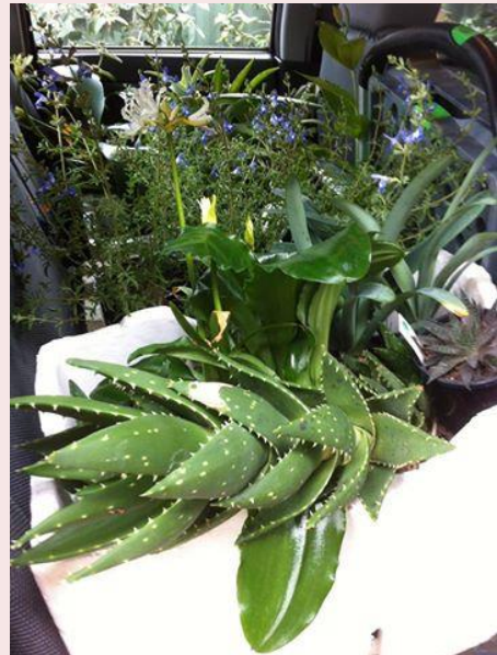
Some Aloes from the RBGV Growing Friends Plant Sale