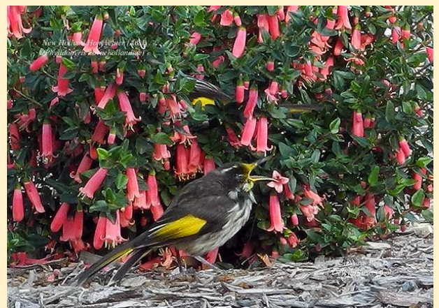
New Holland Honeyeater