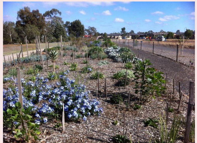
Southern African garden