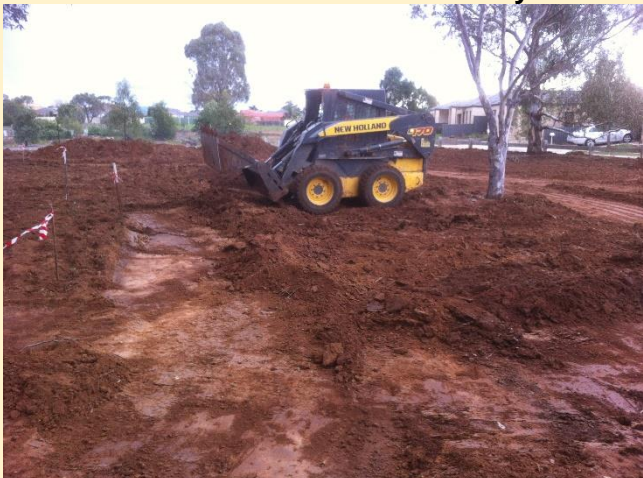
Kelvin forming paths and shaping beds